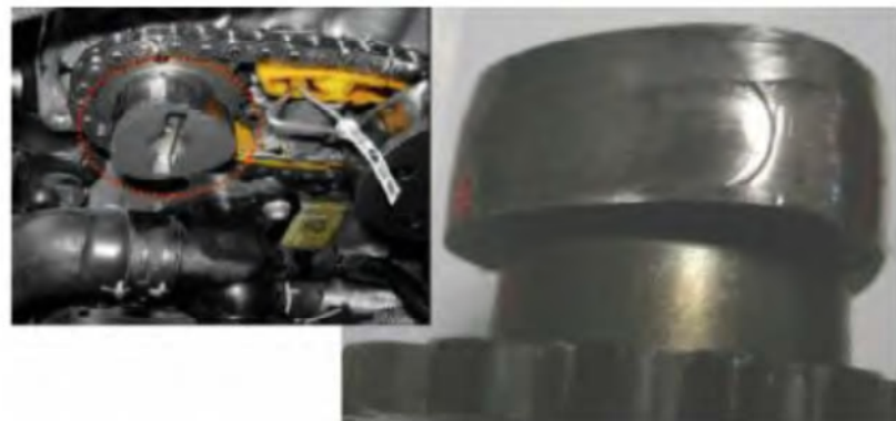
Figure 3. Excessive wear on the lobe for high pressure fuel pump in the intake camshaft.