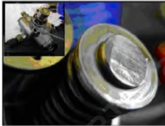
Figure 4. Excessive wear marks on the tip of the high pressure fuel pump plunger.