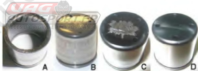
Figure 2. Cam followers in various stages of wear: holed base (A), excessive wear (B), normal wear (C), and new part (D).